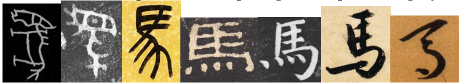
Figure 1.1 Seven calligraphic styles-- From left beginning, they are Oracle Bone Script; Bronze Script; Seal Script; Clerical Script; Regular Script; Running Style and Cursive Style.

In figure 1.1, we can see the natural and frank nature of Oracle Bone Script which reflects the pursuit of beauty. With a natural style of writing, Bronze Script shows a neat and rigorous style. Seal Script shows a beautiful and elegant style as evidenced by the stroke of smooth and round lines. Clerical Script, which has linear symmetric structures and vertical strokes, creates a beauty of steady flexibility. Regular Script has a flexible brushwork. It has a tetragonal and strong structure, and pays attention to the writing procession of “hiding”, “showing”, “hanging”, and “vertical”, which have some of the heroic and generous traits of Regular script. Running Style is energetic and graceful because of its vivid and beautiful lines. Due to the rich strokes, and momentum throughout, Cursive Style creates a dynamic beauty. To sum up, the various calligraphy styles are used to express the different emotions and sentiments of the calligrapher.