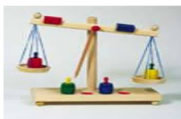
Figure 2: Balance in the Curriculum